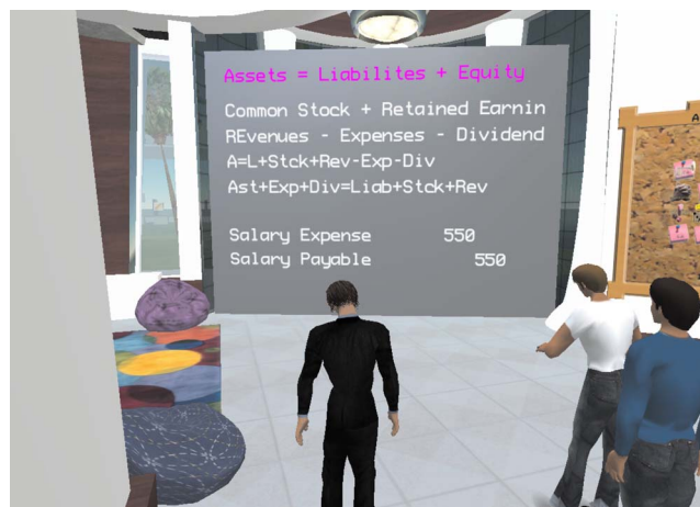
FIGURE 2 Student Study Area

One of the foundational concepts in financial accounting is the accounting equation ( \text{Assets} = \text{Liabilities} + \text{Stockholders Equity} ) and how the elements of the equation are impacted by business transactions which either increase or decrease the values in the equation. It is the accounting equation coupled with new vocabulary used to manipulate the equation (debit and credit) that is the underpinning of the accounting system. Students sometimes have great difficulty in applying the language of accounting, specifically in the case of the accounting equation. To help students understand the equation and how debits and credits affect the different components of the equation, a model of the equation was built. The model contained separate 3-D cubes representing assets, liabilities, and stockholders' equity (for the basic model), and, additionally, revenues and expenses (for the expanded model). Each cube was shaded a different color and the liability and equity cubes were linked so that students could visualize their relationship to the total size of the assets cube. In addition to the 3-D cubes, the equation was also displayed and updated in real time as transactions were entered into the model. Students would interact with the model by "talking"